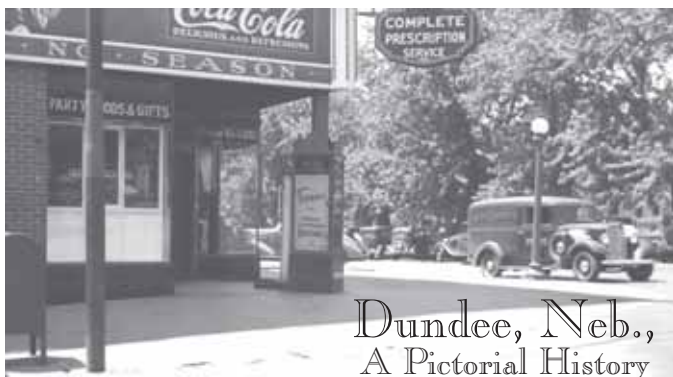
Dundee, Neb., A Pictorial History

To avoid delay... Please send all membership renewals to address on membership form, on the other side of this page. Please. DO NOT send membership forms to the address above.