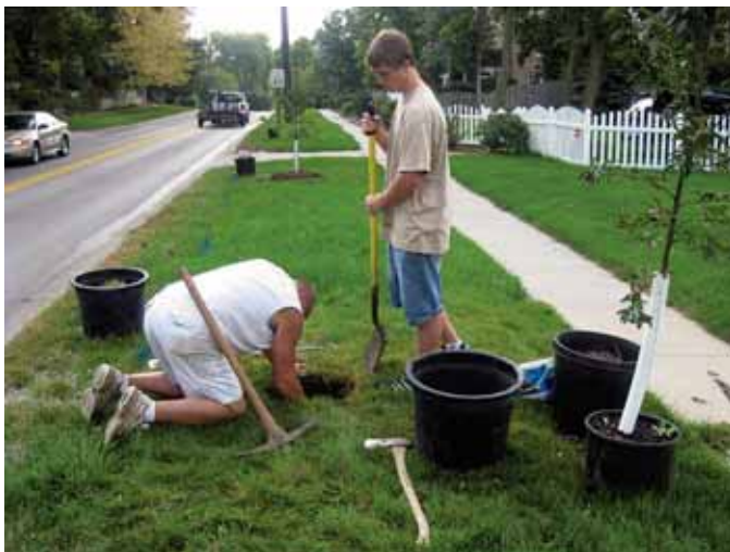
Tree being planted by Indian Creek staff.

Now that the pilot projects have been completed, Re-Tree Midtown will begin work on new projects and applying for additional grants. If a block is interested in participating in possible future plantings, please let me know at drschinzel@hotmail.com .