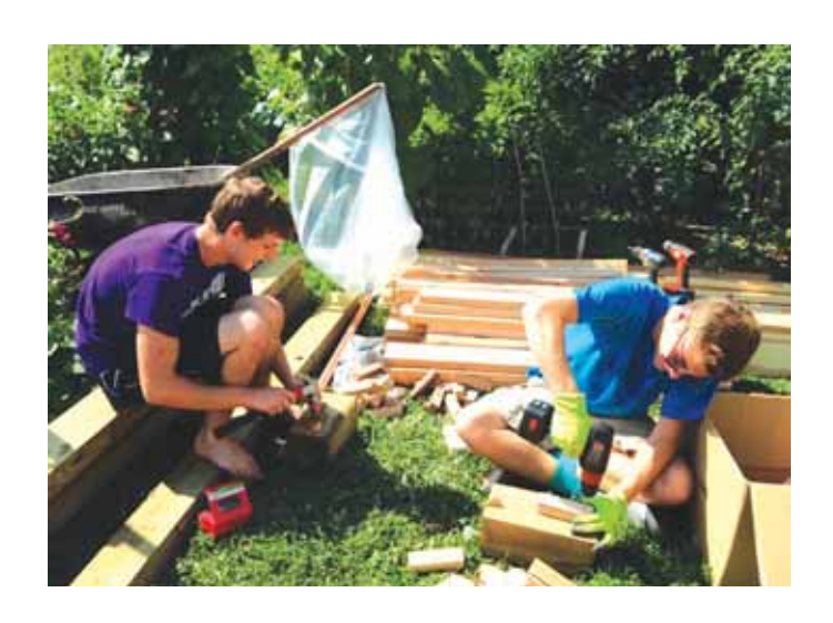
Hard at work building the compost bin.