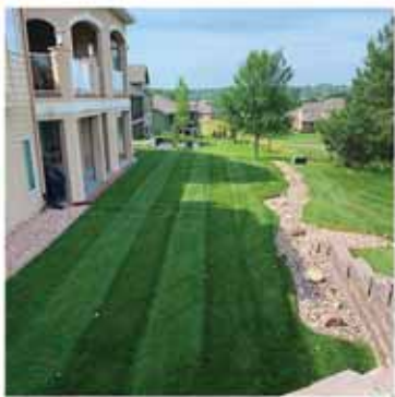
Sustainable Lawn Care Program

Our #1 goal is to maintain your lawn at the very highest quality!