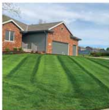
Mowing & Trimming