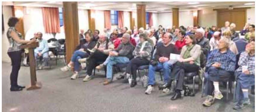
Speaker and crowd April Meeting