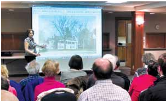
April DMPA Meeting