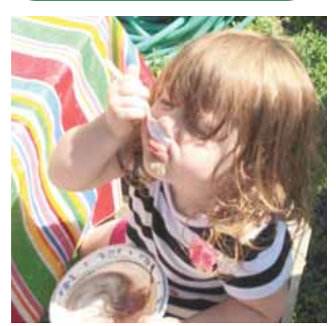
More photos from the DCG Ice Cream Social Inside.

Pancake Breakfast 7 AM - 11 AM Parade starts at 10:30 A.M And much, much more!