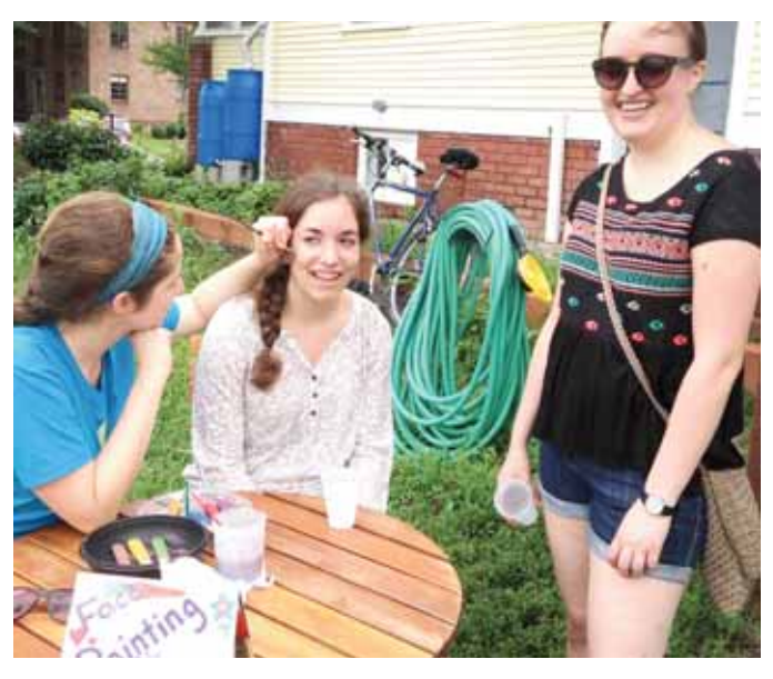
2014 Ice Cream Social was a great success with over 100 people attending.